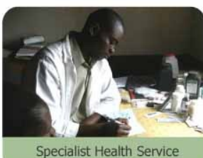
Specialist Health Service