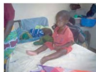
Severe, acute malnutrition