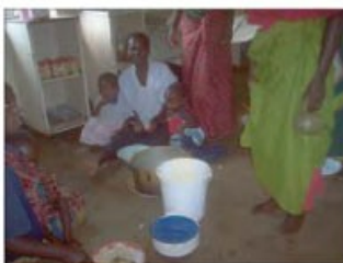
Nutrition rehab unit

A nutritional assessment on 400 children under 5 (including Chimteka catchment) was conducted in 2009 to identify those children who are suffering from moderate acute malnutrition and severe acute malnutrition. 54% of the children were found to have moderate or severe difference from what is a normal weight for age and the corresponding figure for height for age is 64%. This data provides a basis for the establishment of a CTC programme, based in the Chiosya clinic, serving the Chimteka community. There are various treatments for severe acute malnutrition including high calorie milk and Chiponde, which is a peanut-based product. A course of Ready to Use Therapeutic Food, principally Chiponde, is given to those with moderate acute nutrition.