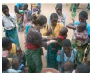
The screening process